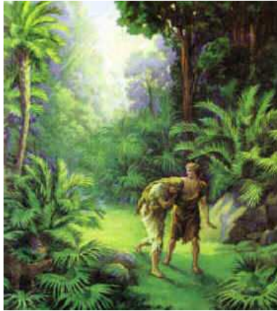
Imvume Yobubi Kanye Nokuhlobana Kwayo Nohlelo Lukankulunkulu