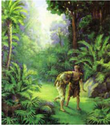
Imvume Yobubi Kanye Nokuhlobana Kwayo Nohlelo Lukankulunkulu