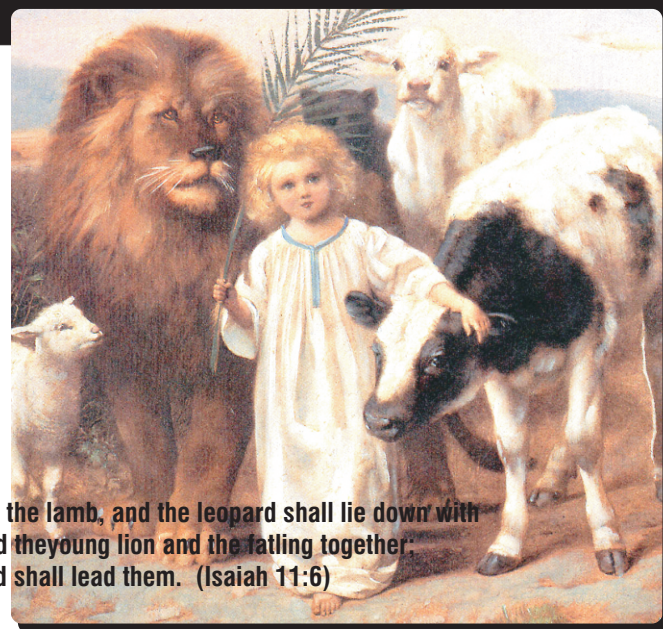
The wolf also shall dwell with the lamb, and the leopard shall lie down with the kid; and the calf and the young lion and the fatted together; and a little child shall lead them. (Isaiah 11:6)